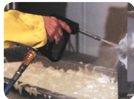
Maintenance-free units protect against the effects of humidity, preventing corrosion and lubrication wash-out

Specifically designed SKF Y-bearing units for the food and beverage industry feature a maintenance-free, stainless steel bearing insert that is fitted with a very efficient multiple-lip seal and a rotating